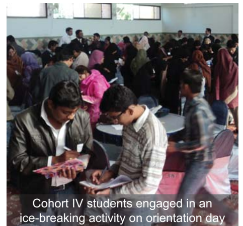
Cohort IV students engaged in an ice-breaking activity on orientation day

An orientation session for Cohort IV was held on 20 December 2010. Students were engaged in exciting activities in which they introduced themselves and mingled with one another. iACT faculty gave them an overview of iACT and the courses offered. Students also engaged in an exciting tree plantation session, to inculcate in them a sense of ownership and caring towards the Institute. Classes began the next day. 128 students mostly between the ages of 17 and 25 are enrolled, with an equal representation of males and females. The students were energized after the session and were eager to start their learning journey at iACT.