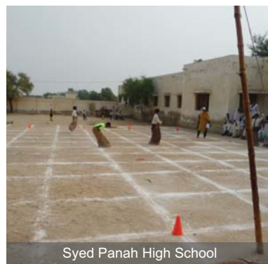
Syed Panah High School