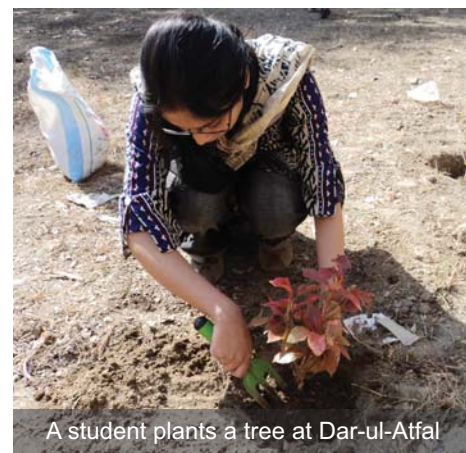
A student plants a tree at Dar-ul-Atfal

Another iACT SAP entitled "Youth to Youth: Knowledge and Skills Sharing" is being implemented at Dar-ul-Atfal (CDGK Girls' Hostel in Korangi). Implemented by iACT graduates of the Textile Designing course, the project reaches out to Pakistani youth and aims to develop useful skills in them. iACT students are sharing the skills they learnt during the course with the students. The project aims to develop marketable skills among youth and help them to initiate their own business. Six sessions have been planned, of which one was conducted in December 2010. 13 students and three teachers benefitted from the session, in which tie and dye techniques were taught.