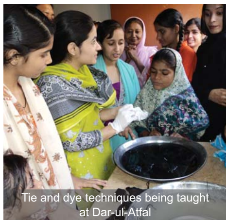
Tie and dye techniques being taught at Dar-ul-Atfal