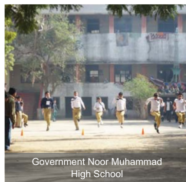
Government Noor Muhammad High School