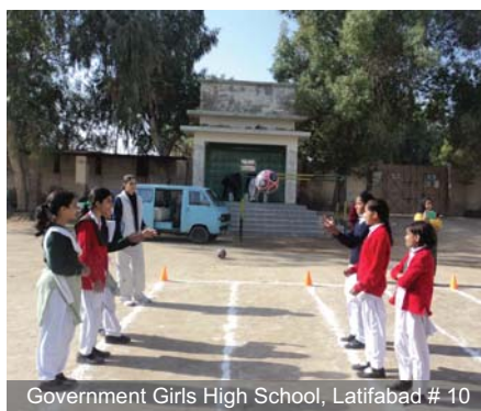
Government Girls High School, Latifabad # 10