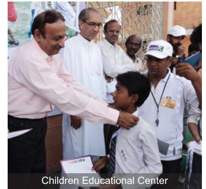
Children Educational Center