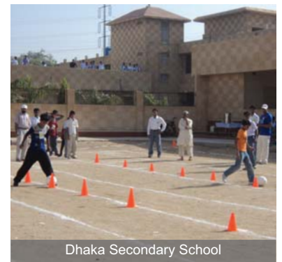
Dhaka Secondary School