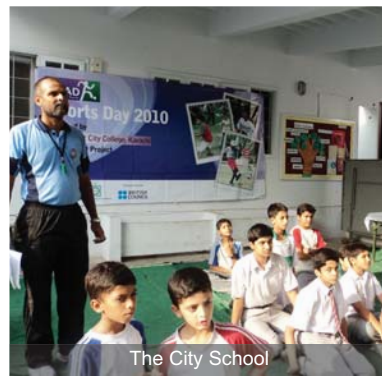
The City School