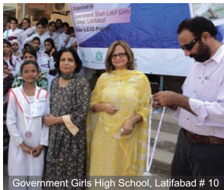
Government Girls High School, Latifabad # 10