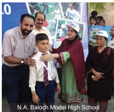
N.A. Baloch Model High School