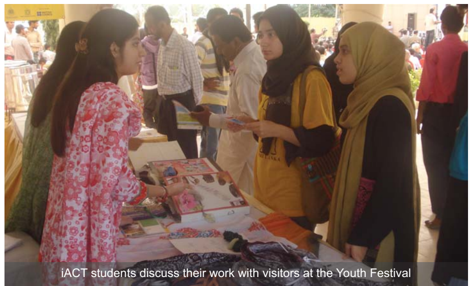
iACT students discuss their work with visitors at the Youth Festival