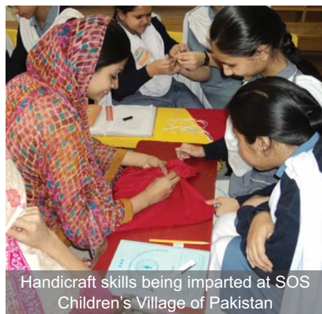
Handicraft skills being imparted at SOS Children's Village of Pakistan