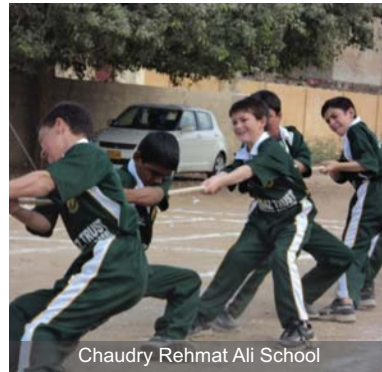
Chaudry Rehmat Ali School