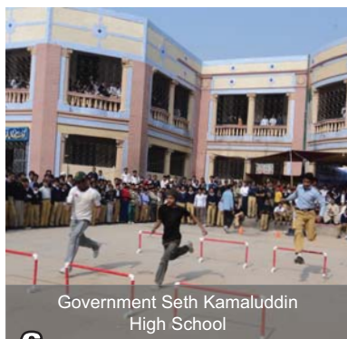
Government Seth Kamaluddin High School