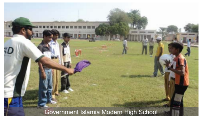
Government Islamia Modern High School