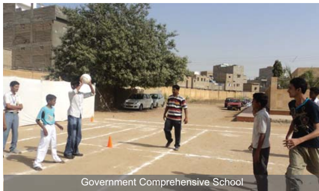
Government Comprehensive School