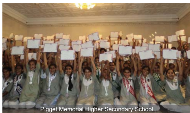
Pigget Memorial Higher Secondary School